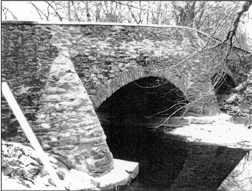
Exhibit IX. 4 Historic Masonry Arch Bridge

structure will not be impacted. If rehabilitation is proposed for an historic bridge, the process is guided by the Secretary of the Interior's Standards for Rehabilitation (available on the Internet at http://www2.cr.nps.gov/tps/secstan1.htm ).