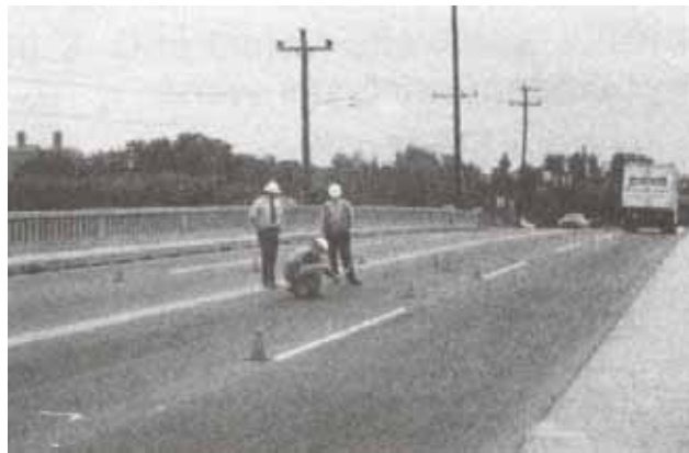
Exhibit VIII.1 Hazardous Working Conditions

Whenever bridge maintenance work is done on or near the roadway, drivers are faced with changing and unexpected traffic conditions. These changes may be hazardous for drivers, workers, and pedestrians unless protective measures are taken. See Exhibit VIII.1. Drivers do not make a distinction between construction, maintenance, or utility operations. Proper traffic control and safety are needed for all types of work.