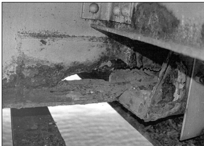
Exhibit IX. 1 Structure with Lead Paint

A number of states are experiencing difficulty in removing lead based paints on deteriorating structures as shown in Exhibit IX.1. The cost of removal operations has increased in response to recent legislation and requirements for containment and disposal of waste containing lead, as well as worker safety. Several issues have emerged, all relating to lead-based paint removal. Maintaining worker safety and minimizing exposure to lead are of paramount importance during maintenance activities. These issues are addressed in Session X-B: Toxic Materials. Lead-based paint removal methods that meet current regulatory requirements have become expensive and are still developing. These methods are covered in Session XIII-E: Spot Painting. A third issue, discussed in this session, is the containment and disposal of the removed lead-based paint material.